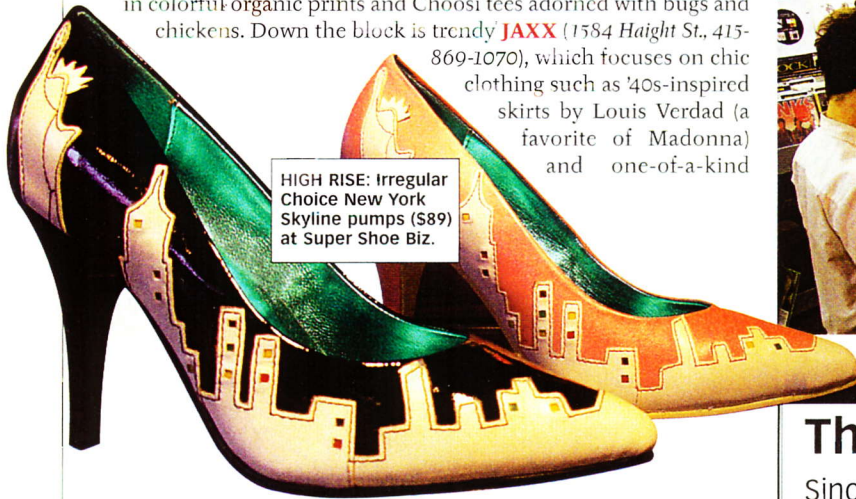
HIGH RISE: Irregular Choice New York Skyline pumps ($89) at Super Shoe Biz.

creations from local designers. The cutting-edge boutique has an upscale, minimalist look and is popular with SF fashion mavens. Want gear that's less Hollywood and more Long Beach? Head to VILLAINS CLOTHING AND SHOES (1672 Haight St., 415-626-5939) for fun, spunky attire at great prices. A sporty/skater look dominates here; keep an eye out for badass Emily pieces for girls and short-sleeved button-downs for guys. The adjacent shoe store is the