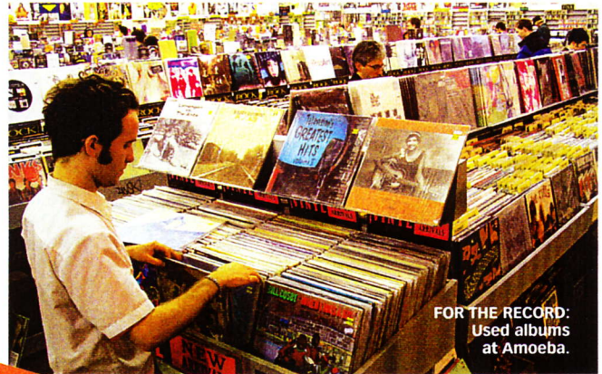
FOR THE RECORD: Used albums at Amoeba.