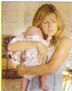
Tami Taylor (Connie Britton) holds her new baby, Gracie. The baby is played by triplets and a doll. The show buys four sets of each outfit, which allows any baby to be ready to shoot.